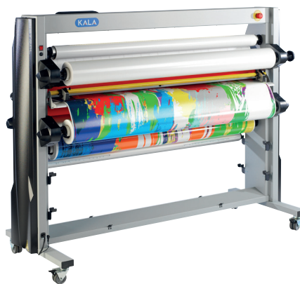
Front and rear view in a Roll to Roll configuration Included options Gas lift, LED light kit and in line slitting