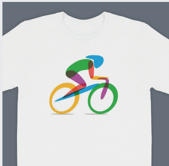
Produced with: JET-PRO® Active Wear