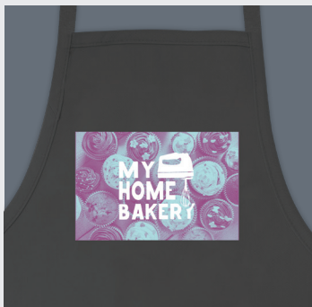
Produced with: 3G JET OPAQUE®