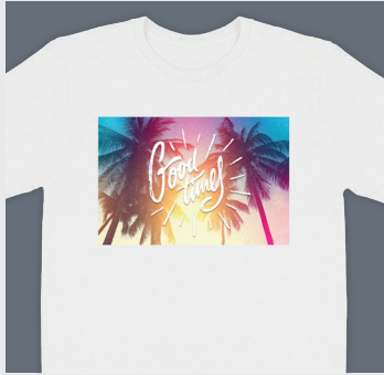
Produced with: JET-PRO® SS