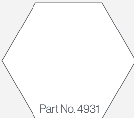
Part No. 4931

Gloss White/Black Back THB, 6,35 mm x 203 mm x 203 mm, R 3,175 mm, 12/case