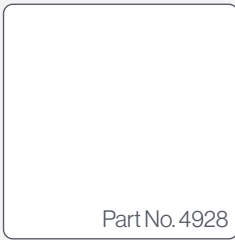
Part No. 4928